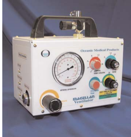
The Magellan ventilator features a pneumatic control system. It's simpler than electronic controls and is more dependable in harsh environments.

"Electronic controls would have a hard time operating in harsh, remote environments," says Gates. "The units routinely face physical