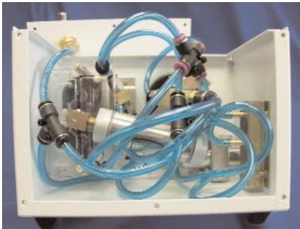
Clippard's R-331 timing valve, behind the tubing.