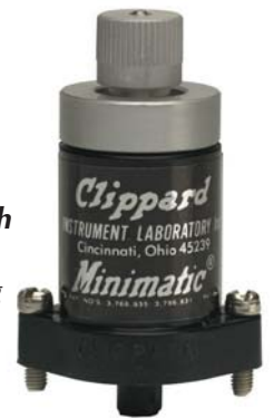
Delayed in Normally-Closed

Careful design and meticulous manufacturing allows Clippard's R-331 timing valves to run with little internal friction, resulting in a 20 million cycle life.